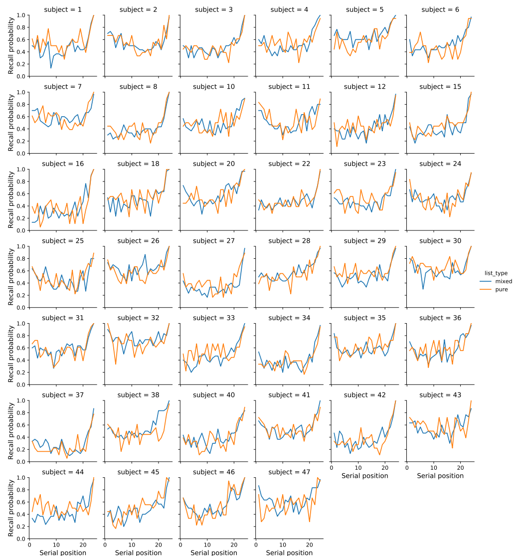
Figure 2: Serial position curve split by list type, with a separate panel for each participant in an experiment.

Similarly, Psifr makes available the full power of the Seaborn visualization package to provide expressive visualization capabilities. The plotting functions in Psifr allow the user to easily view analysis results in different ways; for example, an analysis of recall by serial position can be visualized either as a single plot with error bars (Figure 1) or as a grid of individual plots for each participant in the experiment (Figure 2). Psifr also supports creation of raster plots (Figure 3), a method for visualizing whole free recall datasets to facilitate quick discovery of patterns in the order of recalls (Romani, Katkov, & Tsodyks, 2016).